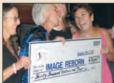
Image Reborn Foundation See page 4